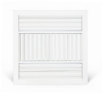
4 WAY BLOW (CR4)