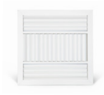
3 WAY BLOW (CR3)