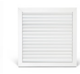
1 WAY BLOW (CR1)