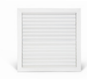
2 WAY BLOW (CR2)