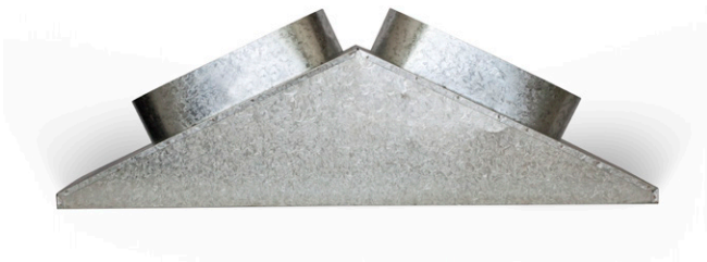
V-Box Two Way (VB2)