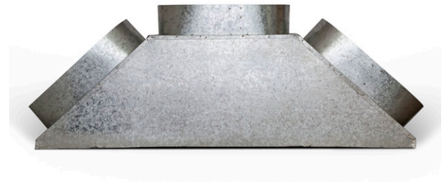
V-Box Three Way (VB3)