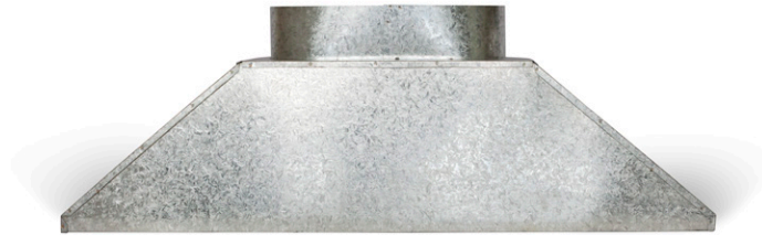
V-Box One Way (VB1)